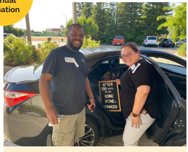
The Eachus Family